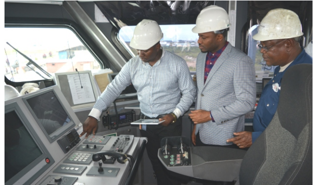
Navigational & Communication Services