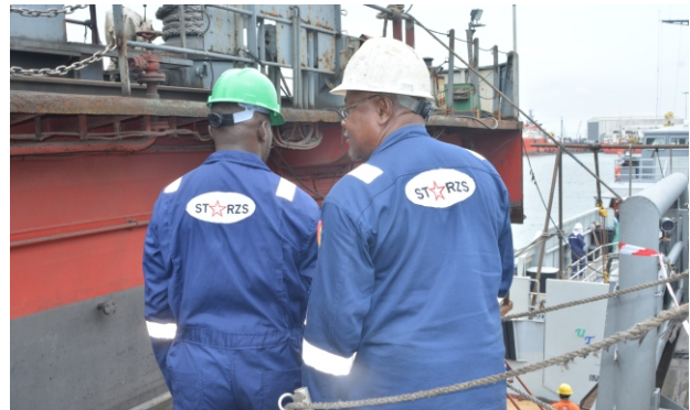
Marine & Engineering Services