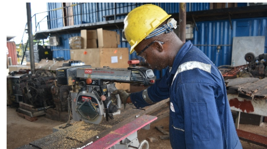
STARZS Engineers at work