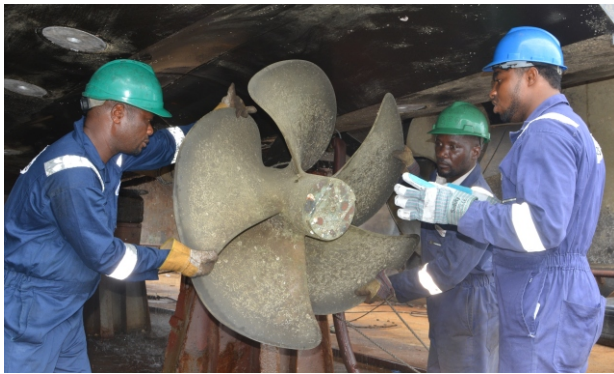
STARZS Engineers at work

We can dry dock vessels up to 500-ton dead weight.